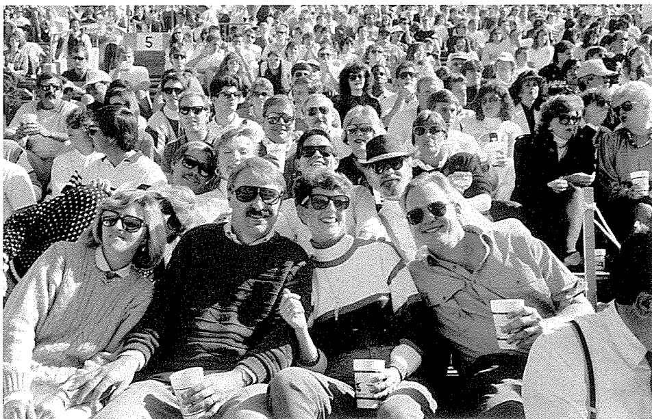
Seats on the 35 yard line!