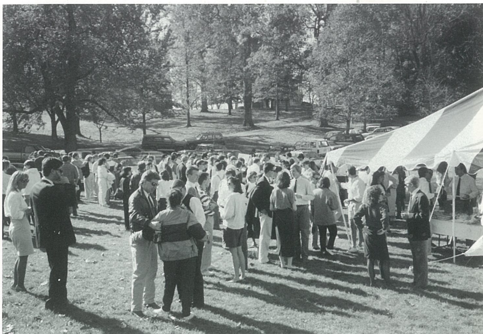
Tailgating at the Duckpond AXA only!