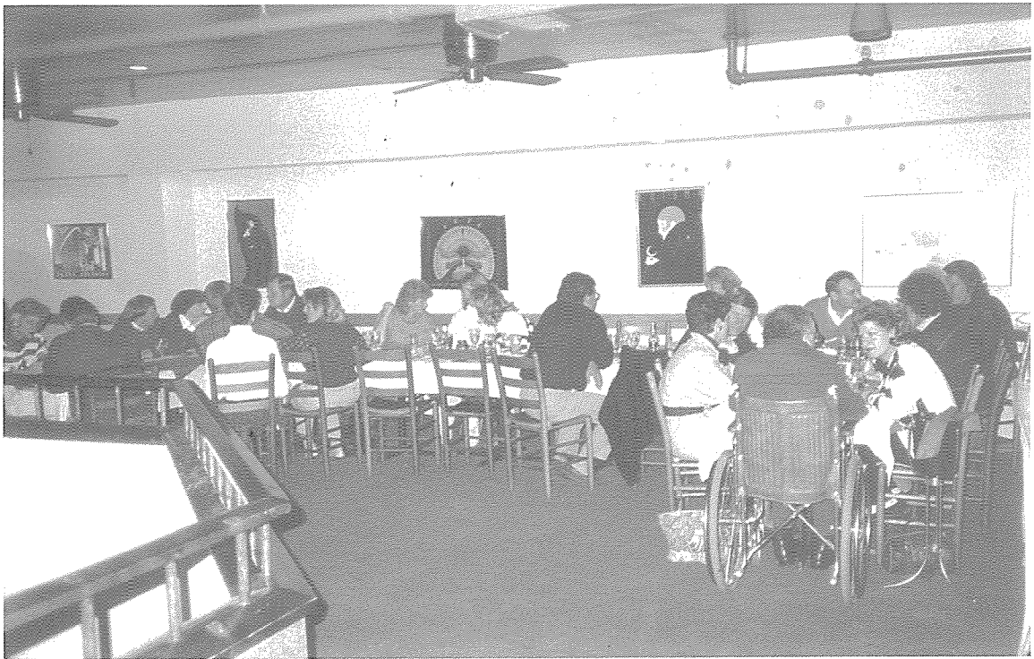
25 Alumni/Spouses take over Crickett's Friday night for dinner.