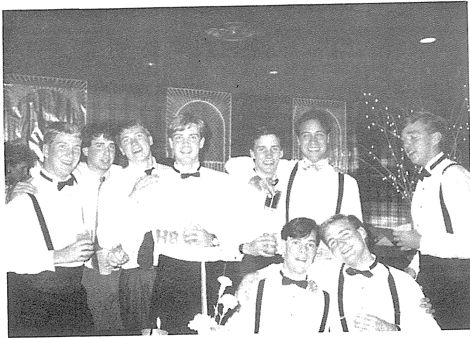
(The Rookies, Having A Blast At Formals)