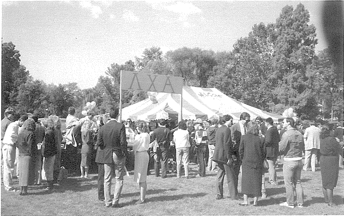
Everyone having a ball at the Homecoming tailgate.