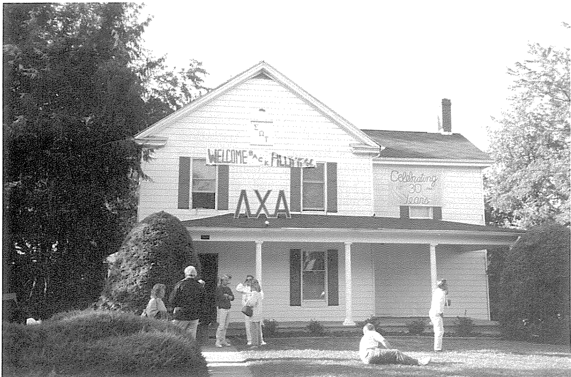
The house in excellent shape for the 30th reunion.