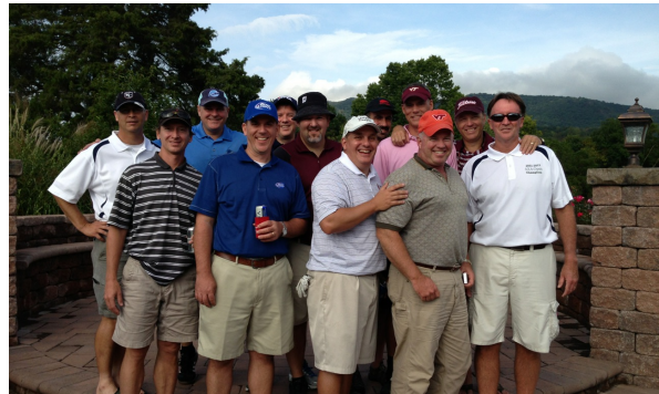
Type to enter a caption.

Omega Memorial Service for Deceased Brothers, War Memorial Chapel, 9:00 am